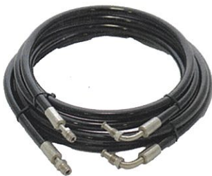
The Panther XPS System is designed to be installed on 75 to 250 hp outboard motors that are equipped with a feedback helm with a single steering-cable system.

The hose kit contains two hoses—high pressure and low pressure—with fittings. The low-pressure hose is 12" longer to allow for uninterrupted travel when connected to the cylinder actuator.